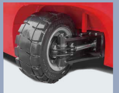
Smaller turning radius