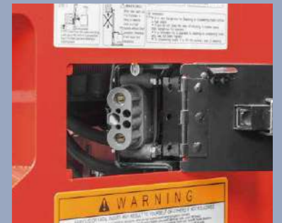
Charging plug inside operator's compartment, this eliminates the need to disconnect the plug from battery, enhancing ease of operation (Std)