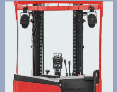
New designed mast and the large open steel roof provide super visibility and safety