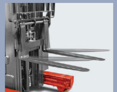
Forks can tilt forward/backward for easy loading